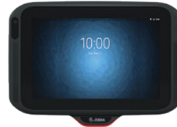
CC600 / CC6000

To learn more about Zebra's commitment to IT security, visit: zebra.com/product-security