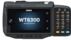
WT6300 WEARABLE COMPUTER