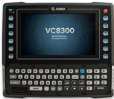
VC8300 VEHICLE MOUNT COMPUTER