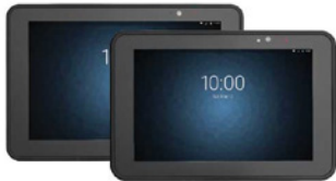
ET51 / ET56