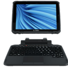
ET80 / ET85 WINDOWS RUGGED 2-IN-1 TABLET